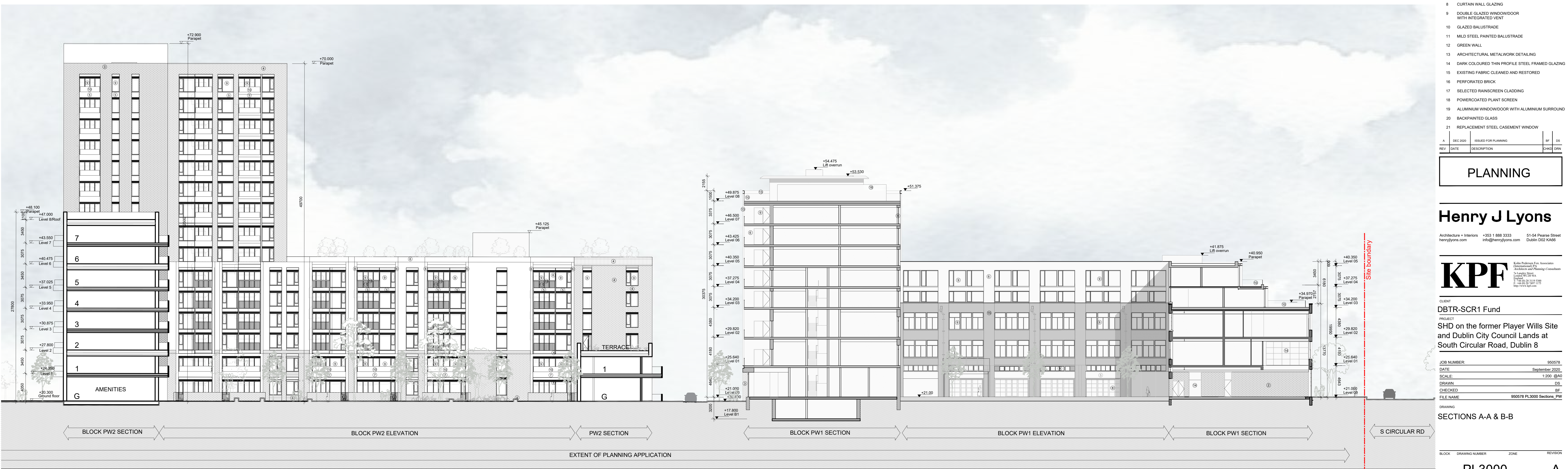
02 Section B Player Wills Site SCALE 1:200